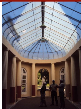
Reynolds Mansion Skylights

The original Mansion was designed and built from tabby, a mixture of lime, shells and water, by Thomas Spalding, an architect, statesman and plantation owner who purchased the south end of Sapelo Island in 1802.