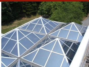
The UGA Botanical Gardens

This 313-acre botanical garden on the Middle Oconee River serves as a cultural, educational and recreational facility and is one of Athens' most-visited attractions. The conservatory is operated by the University of Georgia. The building houses the tropical gardens and is rented for weddings and black-tie affairs.